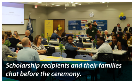
Scholarship recipients and their families chat before the ceremony.