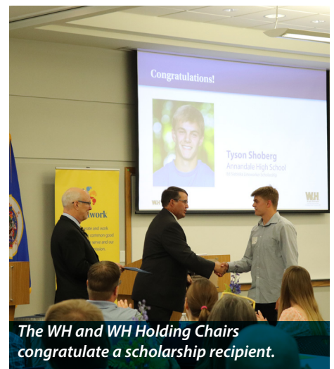
The WH and WH Holding Chairs congratulate a scholarship recipient.