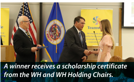
A winner receives a scholarship certificate from the WH and WH Holding Chairs.

Basin Electric scholarship Basin Electric Power Cooperative awards a scholarship to its distribution cooperative members. Basin is one of WH's wholesale power suppliers. Since 2003, Basin has awarded $26,000.