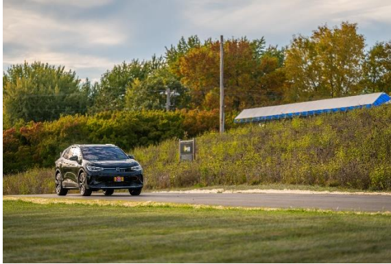
A WH member test drives one of the electric vehicles available at the 2022 EV Ride and Drive.