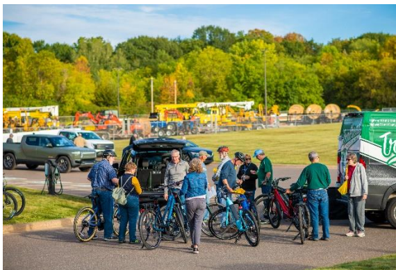
EV Ride & Drive Event attendees check out the electric bikes available for test rides at the 2022 EV Ride and Drive.